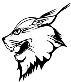
Photo Not Available