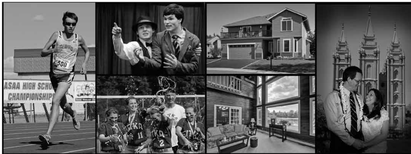
Sports/Events - Real Estate/Architecture - Wedding/Portraits