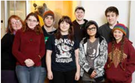
Haines Glacier Bears