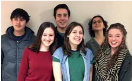
Juneau-Douglas Crimson Bears