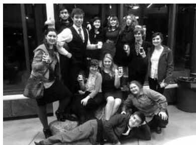
Juneau Douglas Crimson Bears