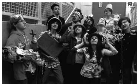
Bartlett Golden Bears