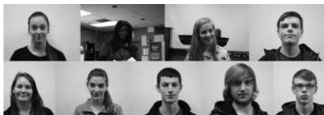
Grace Christian Grizzlies