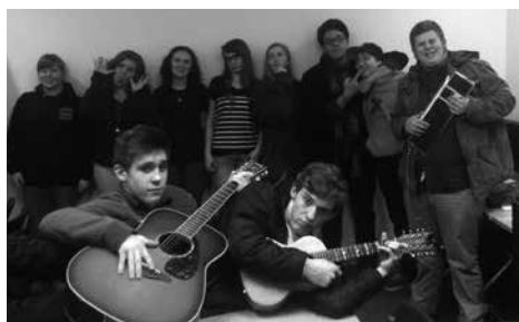
Haines Glacier Bears