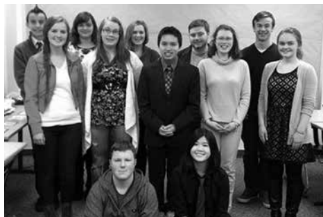
Eagle River Wolves