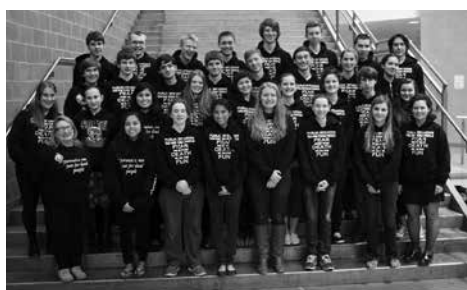
South Anchorage Wolverines