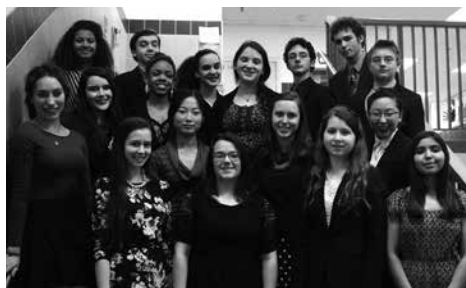
West Anchorage Eagles