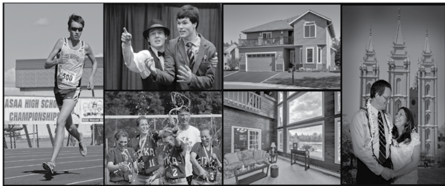
Sports/Events - Real Estate/Architecture - Wedding/Portraits

klaneak@gmail.com - 907-382-7460 Anchorage, AK