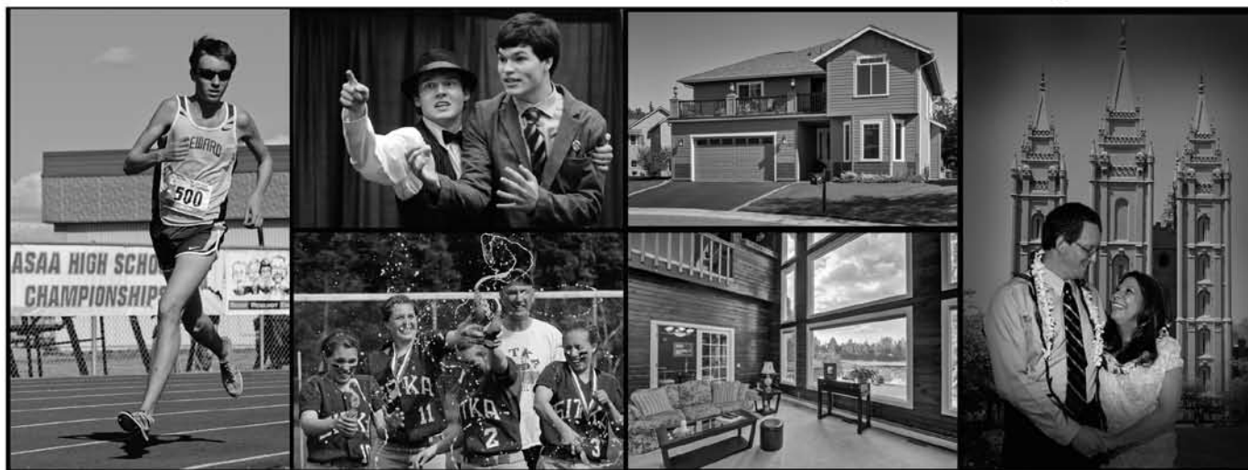
Sports/Events - Real Estate/Architecture - Wedding/Portraits