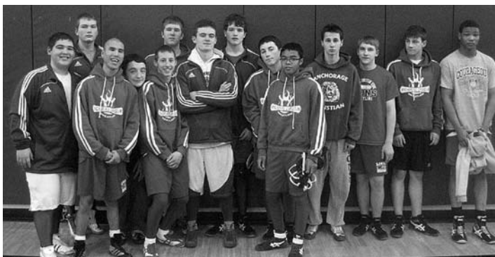
ANCHORAGE CHRISTIAN LIONS