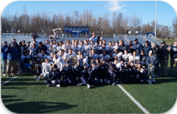
Medium Schools Football Champions - Soldotna