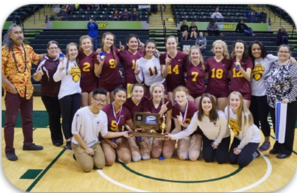
4A Volleyball State Champion - Dimond Lynx