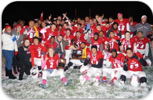
Large Schools Football Champions - East Anchorage