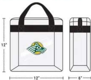
CLEAR BAGS No larger than 12" x 6" x 12"