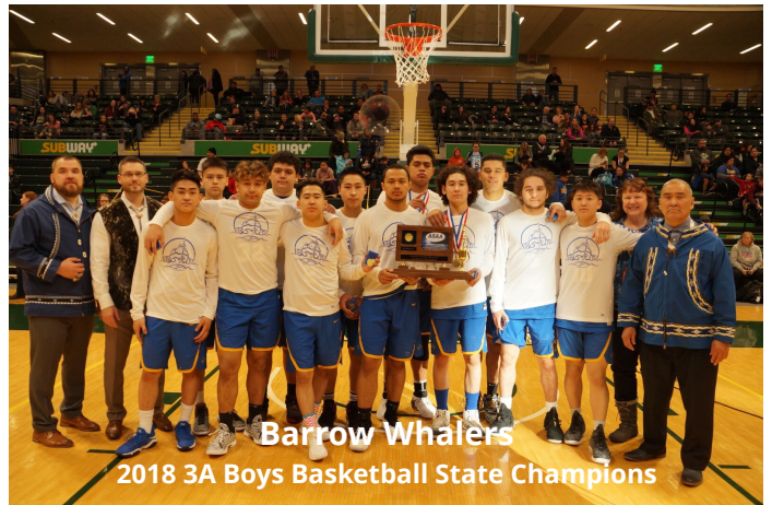
Barrow Whalers 2018 3A Boys Basketball State Champions