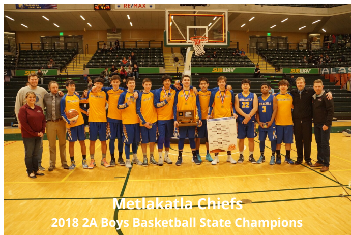
Metlakatla Chiefs 2018 2A Boys Basketball State Champions