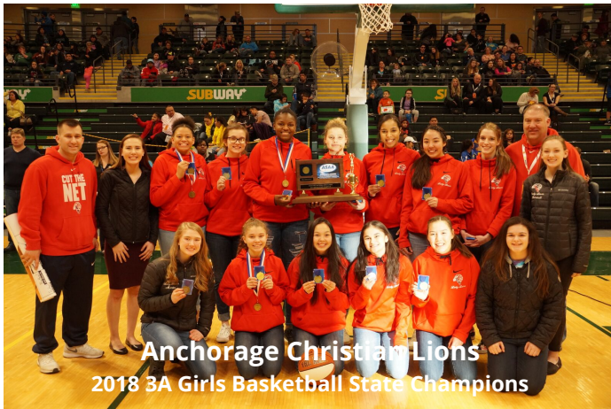
Anchorage Christian Lions 2018 3A Girls Basketball State Champions