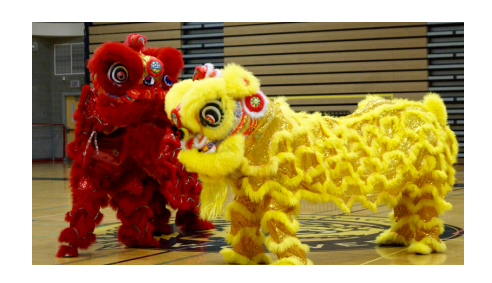
ASAA/FIRST NATIONAL BANK ALASKA WORLD LANGUAGE DECLAMATION March 3, 2018 South Anchorage High School More Information