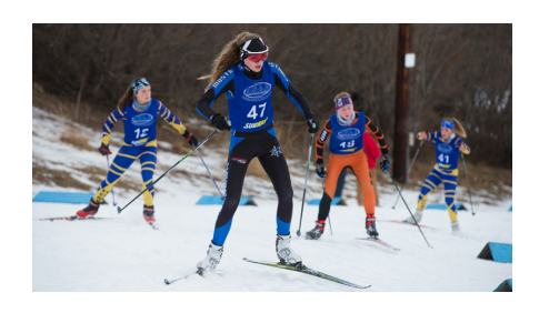
ASAA/FIRST NATIONAL BANK ALASKA NORDIC SKI STATE CHAMPIONSHIPS February 22-24, 2018 Birch Hill in Fairbanks More Information