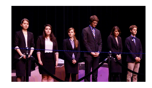
ASAA/FIRST NATIONAL BANK ALASKA DDF STATE CHAMPIONSHIP February 22-24, 2018 East Anchorage High School More Information