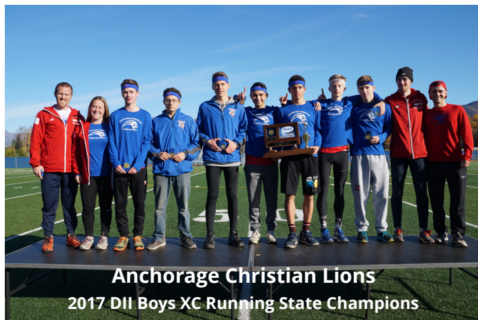
Anchorage Christian Lions