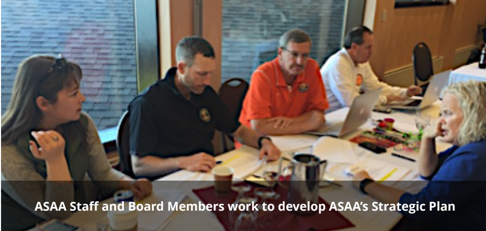
ASAA Staff and Board Members work to develop ASAA's Strategic Plan