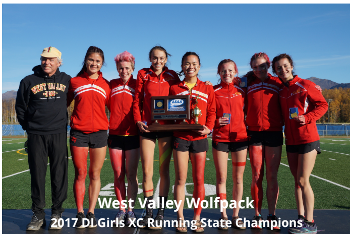
West Valley Wolfpack