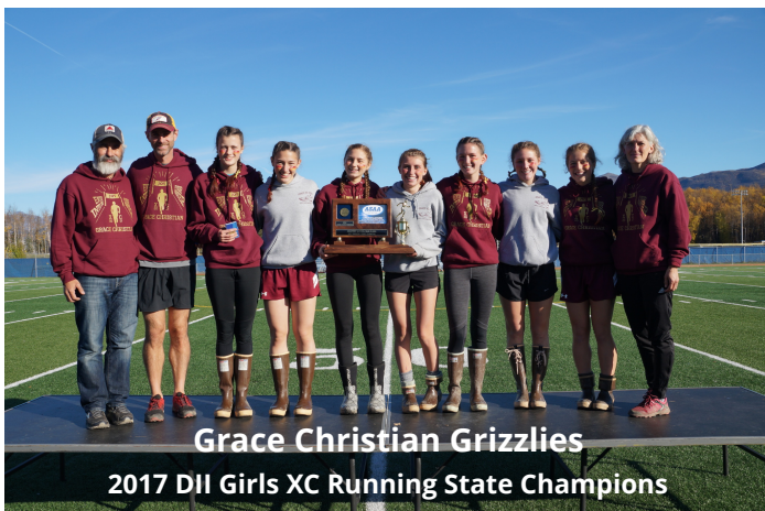
Grace Christian Grizzlies