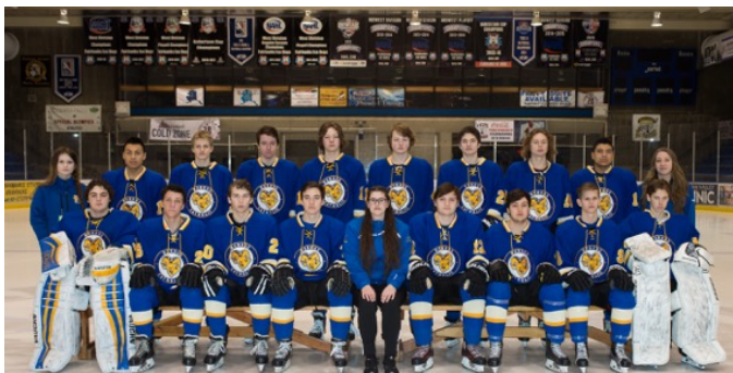
MONROE CATHOLIC 2017 GREATLAND HOCKEY STATE CHAMPIONS