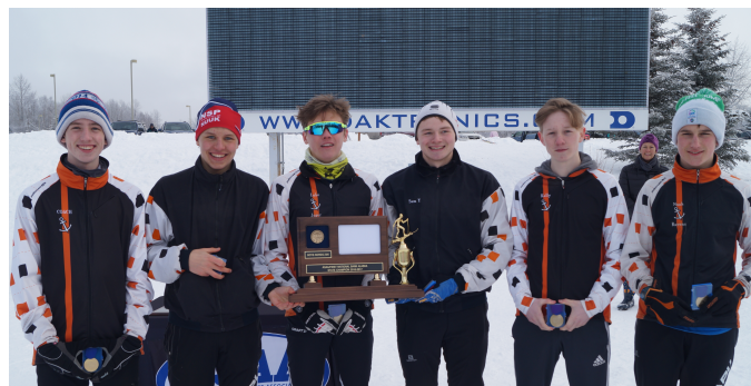
WEST ANCHORAGE EAGLES 2017 BOYS TEAM NORDIC SKI STATE CHAMPIONS