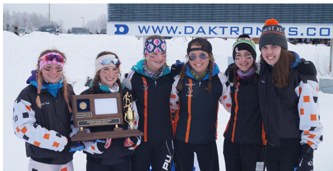
WEST ANCHORAGE EAGLES 2017 GIRLS TEAM NORDIC SKI STATE CHAMPIONS