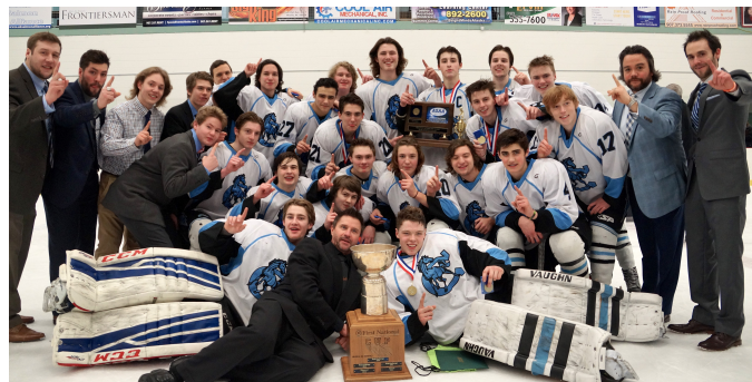
CHUGIAK MUSTANGS 2017 4A HOCKEY STATE CHAMPIONS