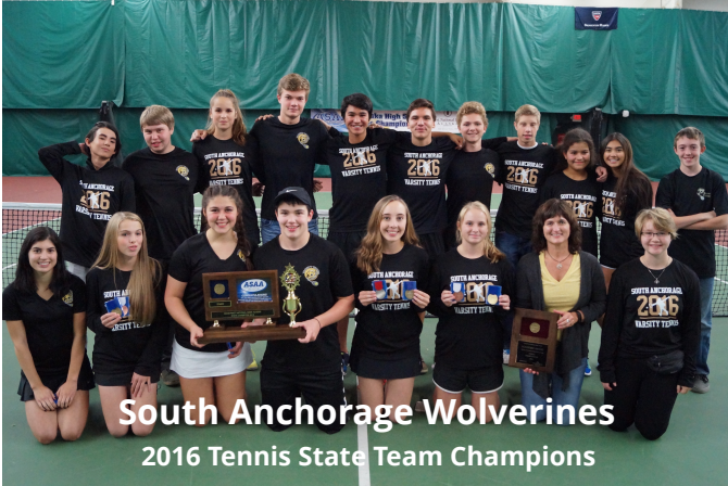
South Anchorage Wolverines 2016 Tennis State Team Champions