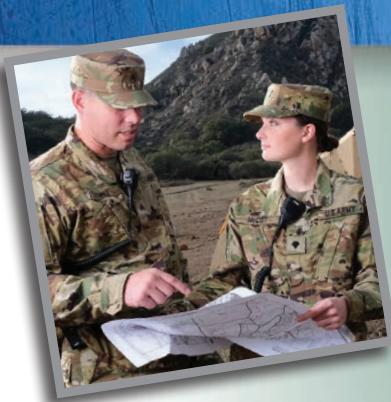
Programs and Benefits Subject to Change

The Army National Guard is the ultimate learning experience. Think about it: We'll help you pay for college, train you in a valuable new career, and put you in position to serve your community in times of need. And it is part-time. Where else can you get all that?