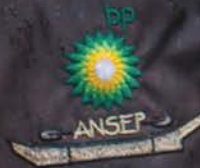
Sean Glasheen Production Engineer BP Alaska

Find out more about BP Alaska at alaska.bp.com