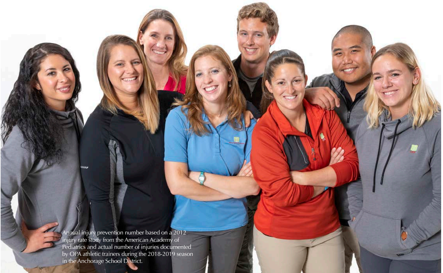
Annual injury prevention number based on a 2012 injury rate study from the American Academy of Pediatrics and actual number of injuries documented by OPA athletic trainers during the 2018-2019 season in the Anchorage School District.

Learn more at OPAlaska.com/athletic-training