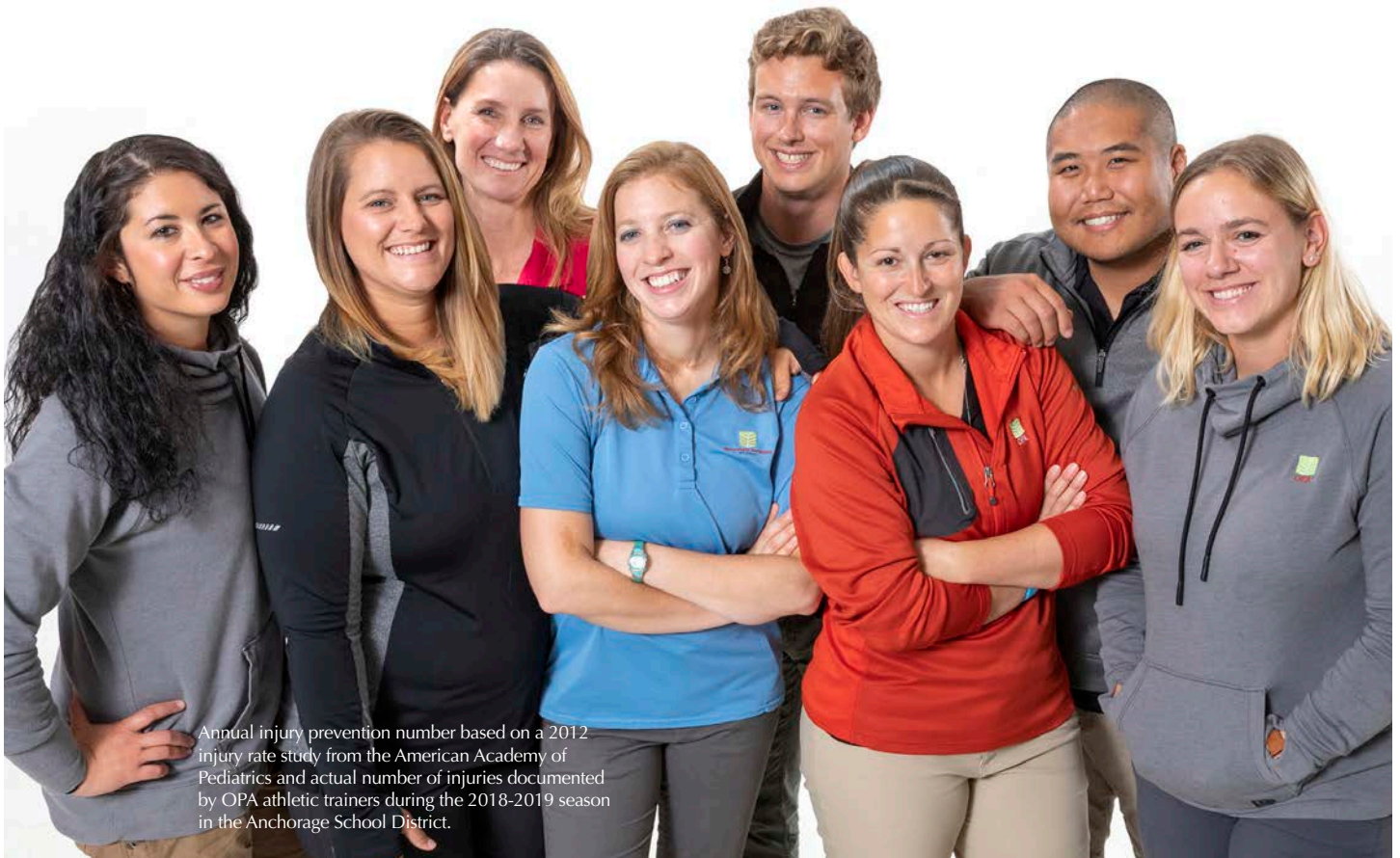
Annual injury prevention number based on a 2012 injury rate study from the American Academy of Pediatrics and actual number of injuries documented by OPA athletic trainers during the 2018-2019 season in the Anchorage School District.

Learn more at OPAlaska.com/athletic-training