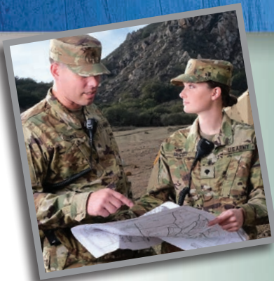
Programs and Benefits Subject to Change

The Army National Guard is the ultimate learning experience. Think about it: We'll help you pay for college, train you in a valuable new career, and put you in position to serve your community in times of need. And it is part-time. Where else can you get all that?