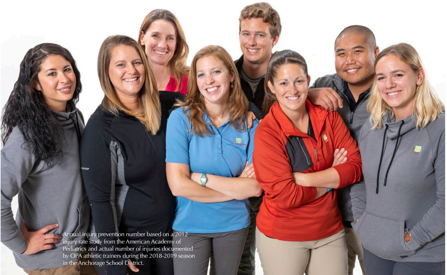
Annual injury prevention number based on a 2012 injury rate study from the American Academy of Pediatrics and actual number of injuries documented by OPA athletic trainers during the 2018-2019 season in the Anchorage School District.

Learn more at OPAlaska.com/athletic-training