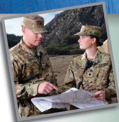
Programs and Benefits Subject to Change

The Army National Guard is the ultimate learning experience. Think about it: We'll help you pay for college, train you in a valuable new career, and put you in position to serve your community in times of need. And it is part-time. Where else can you get all that?