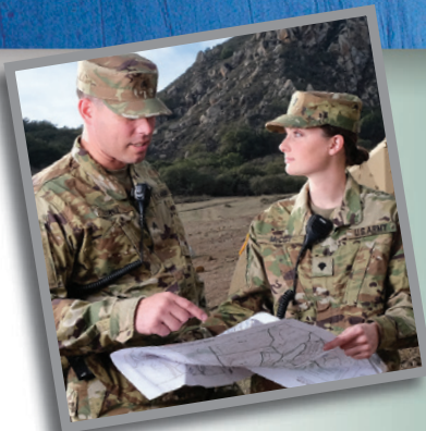
Programs and Benefits Subject to Change

The Army National Guard is the ultimate learning experience. Think about it: We'll help you pay for college, train you in a valuable new career, and put you in position to serve your community in times of need. And it is part-time. Where else can you get all that?