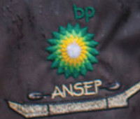
Sean Glasheen Production Engineer BP Alaska

Find out more about BP Alaska at alaska.bp.com