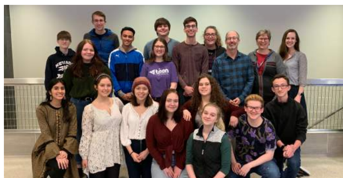
Thunder Mountain Falcons