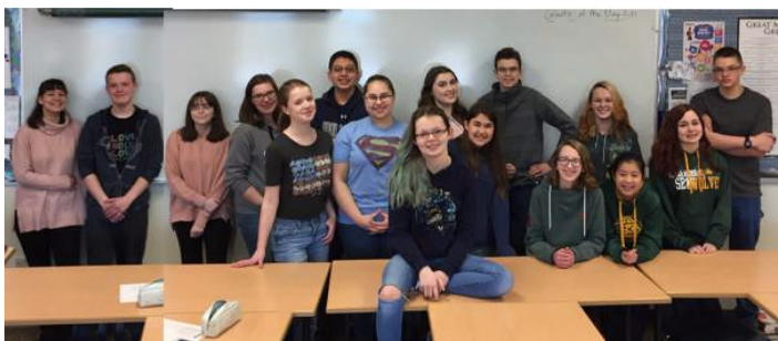
Eagle River Wolves