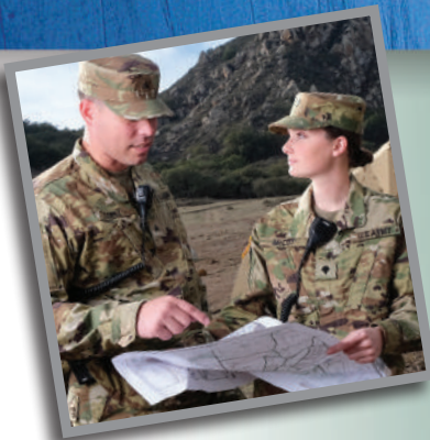
Programs and Benefits Subject to Change

The Army National Guard is the ultimate learning experience. Think about it: We'll help you pay for college, train you in a valuable new career, and put you in position to serve your community in times of need. And it is part-time. Where else can you get all that?