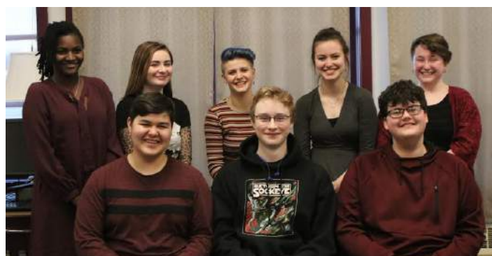
Mt. Edgecumbe Braves