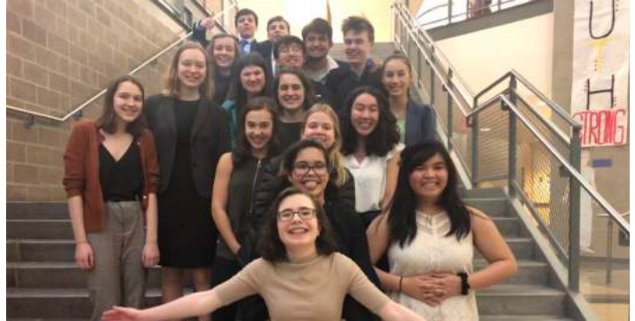
West Anchorage Eagles