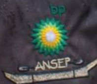
Sean Glasheen Production Engineer BP Alaska

Find out more about BP Alaska at alaska.bp.com