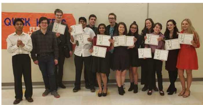
South Anchorage Wolverines