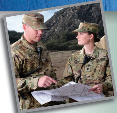
Programs and Benefits Subject to Change

The Army National Guard is the ultimate learning experience. Think about it: We'll help you pay for college, train you in a valuable new career, and put you in position to serve your community in times of need. And it is part-time. Where else can you get all that?