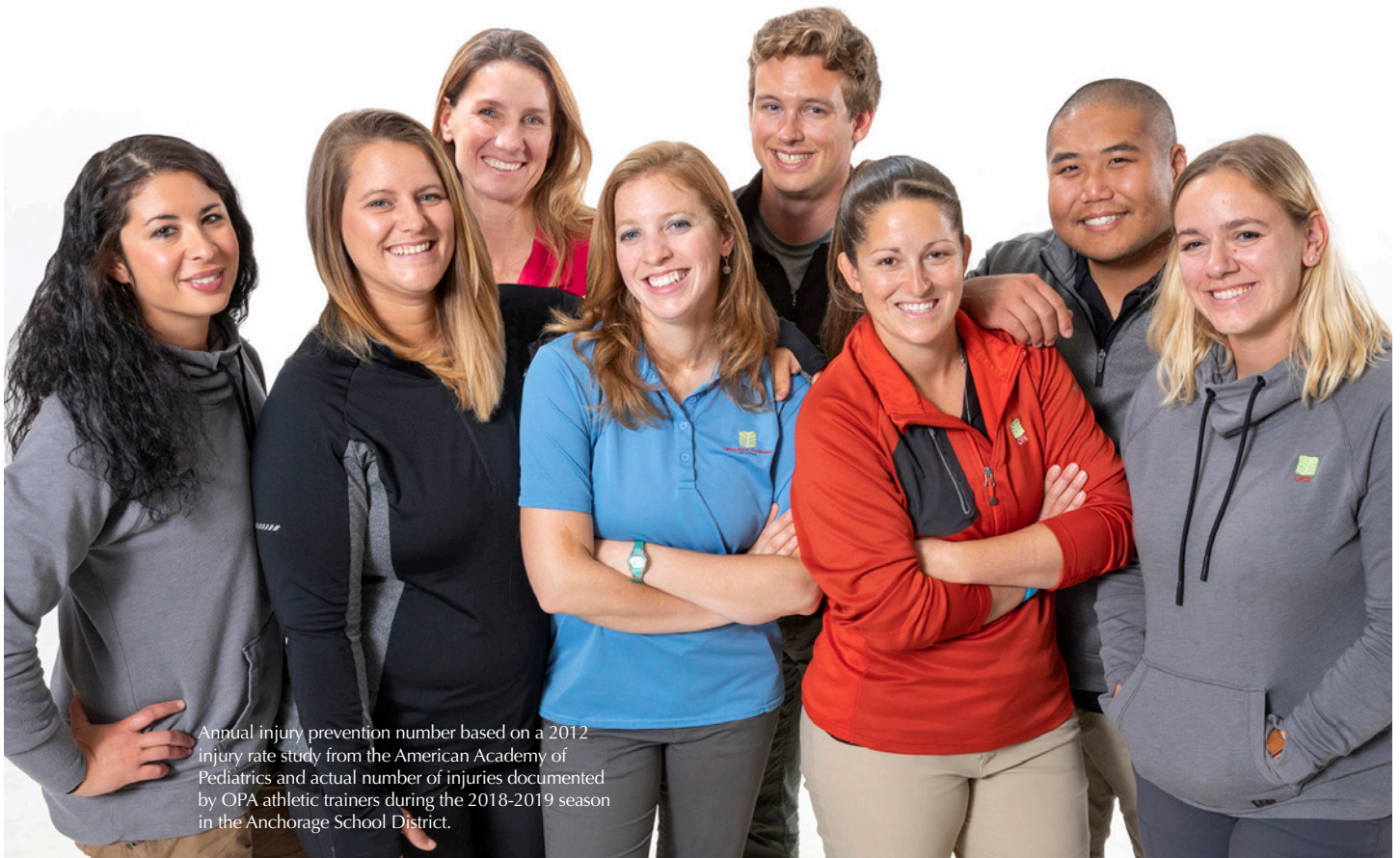
Annual injury prevention number based on a 2012 injury rate study from the American Academy of Pediatrics and actual number of injuries documented by OPA athletic trainers during the 2018-2019 season in the Anchorage School District.

Learn more at OPAlaska.com/athletic-training