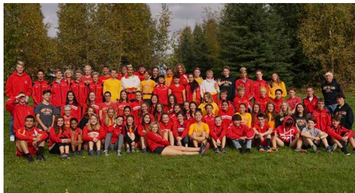
West Valley Wolf Pack