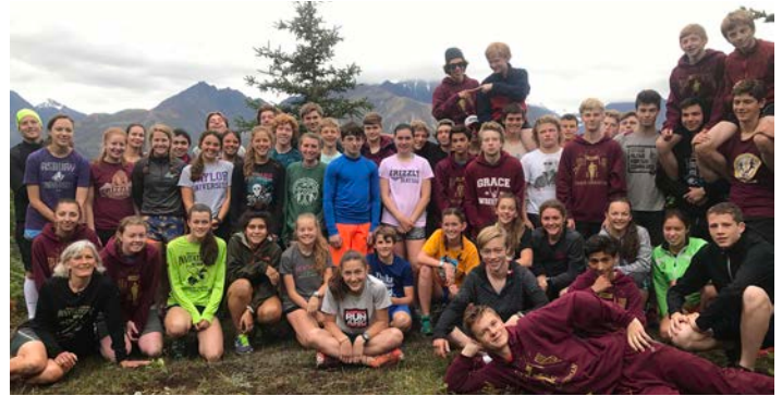
Grace Christian Grizzlies