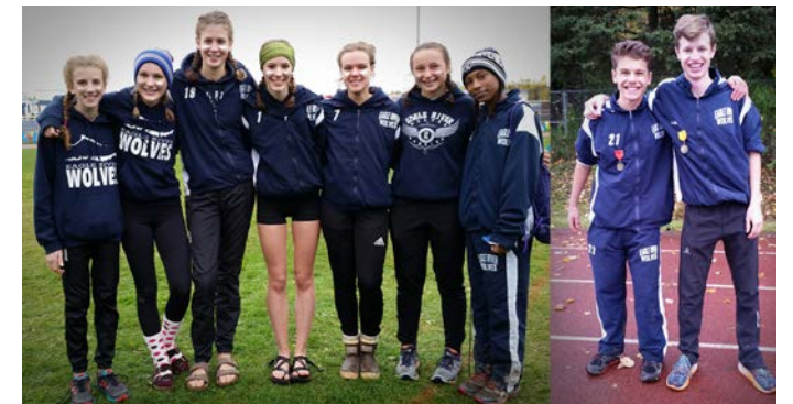
Eagle River Wolves