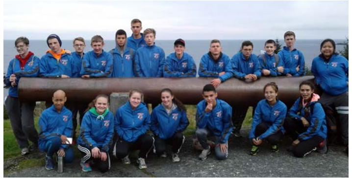
Anchorage Christian Lions