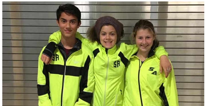
South Anchorage Wolverines