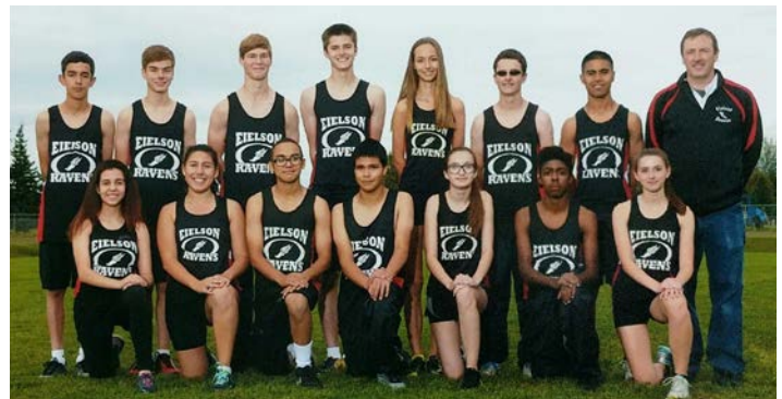
Ben Eielson Ravens