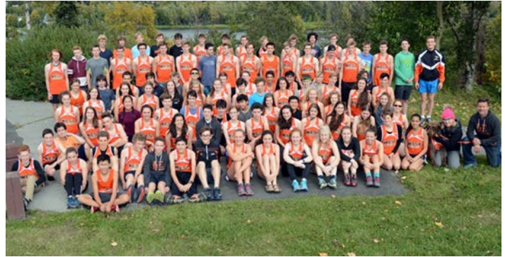
West Anchorage Eagles