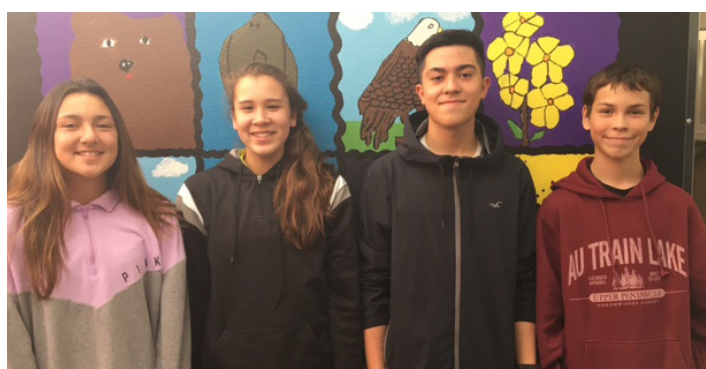
King Cove T'Jacks