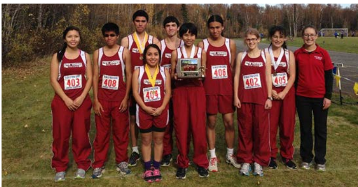
Effie Kokrine Warriors