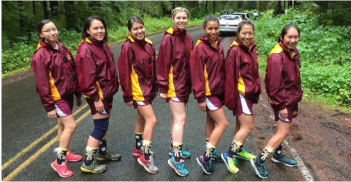
Mt. Edgecumbe Braves