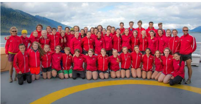
Juneau-Douglas Crimson Bears