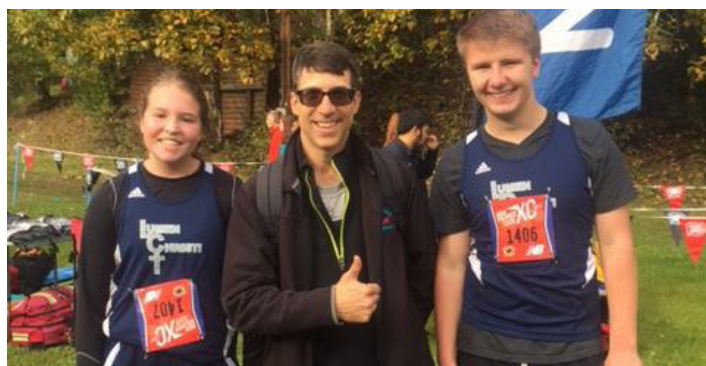
Lumen Christi Archangels