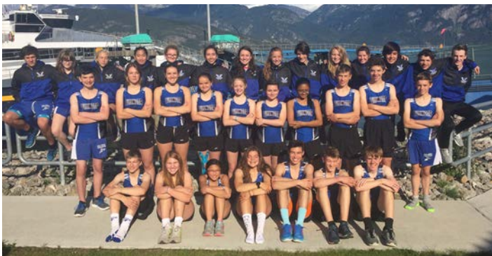
Thunder Mountain Falcons