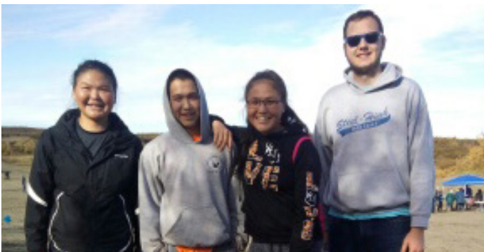
Akula Elitnaurvik Tundra Foxes