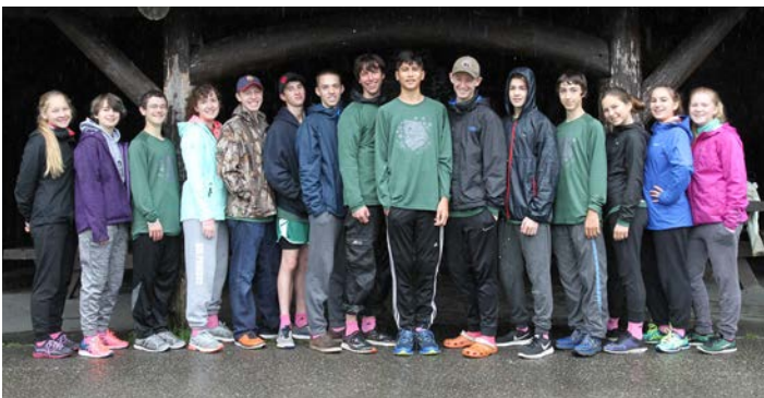
Haines Glacier Bears