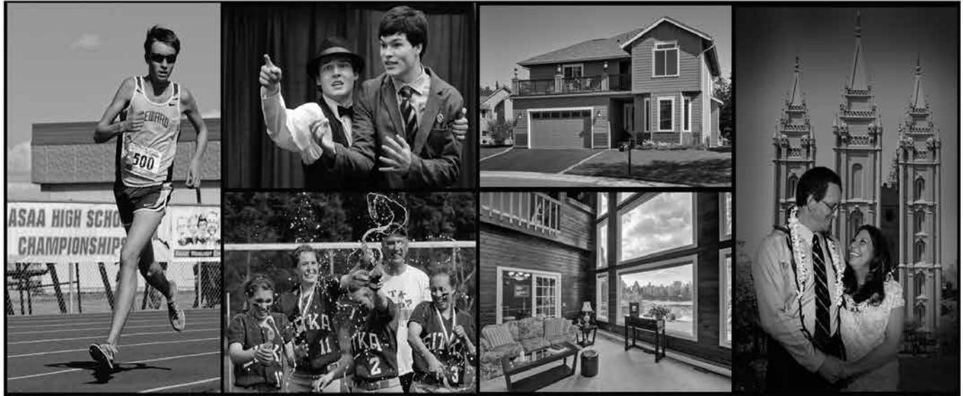
Sports/Events - Real Estate/Architecture - Wedding/Portraits

klaneak@gmail.com - 907-382-7460 Anchorage, AK