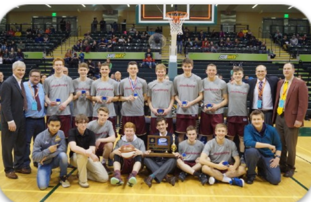
3A Boys Basketball Champions - Grace Christian Grizzlies