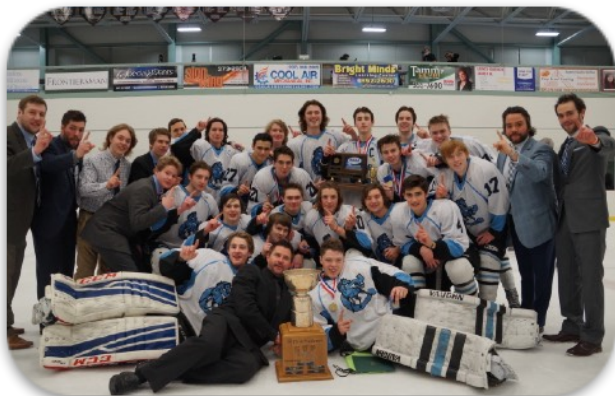
4A Hockey Champions - Chugiak Mustangs