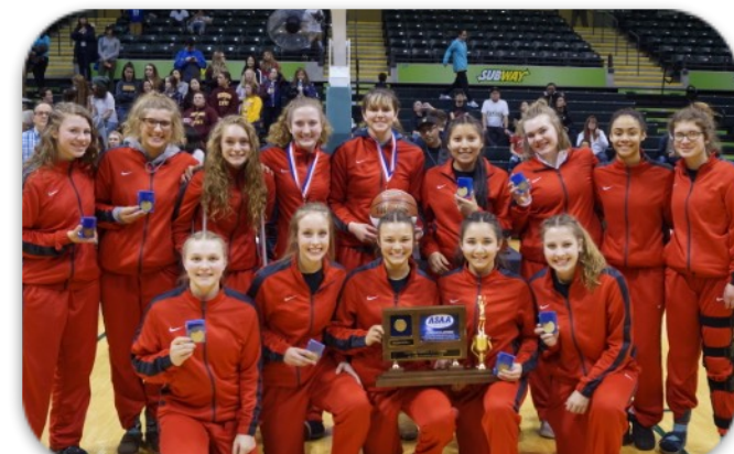
4A Girls Basketball Champions - Wasilla Warriors