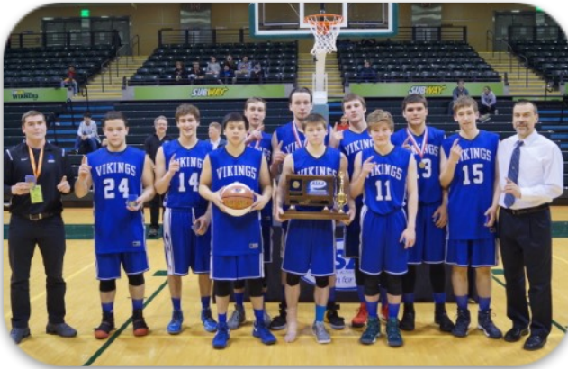
2A Boys Basketball Champions - Petersburg Vikings