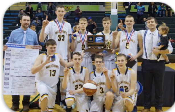
1A Boys Basketball Champions - Ninilchik Wolverines