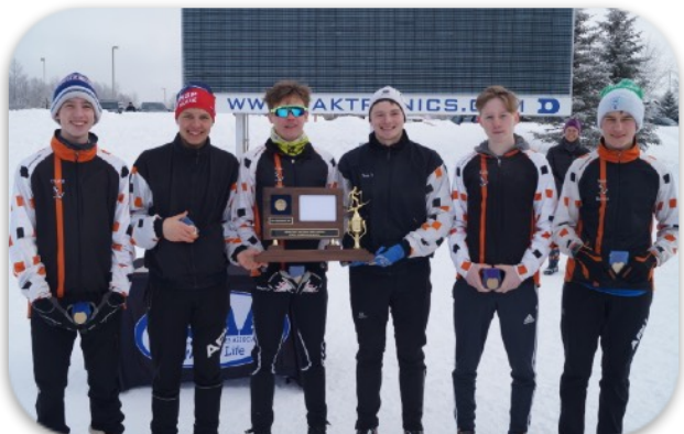
Boys Nordic Ski Champions - West Anchorage Eagles