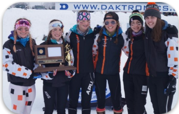
Girls Nordic Ski Champions - West Anchorage Eagles