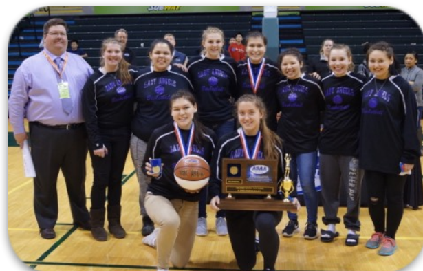
2A Girls Basketball Champions - Bristol Bay Angels