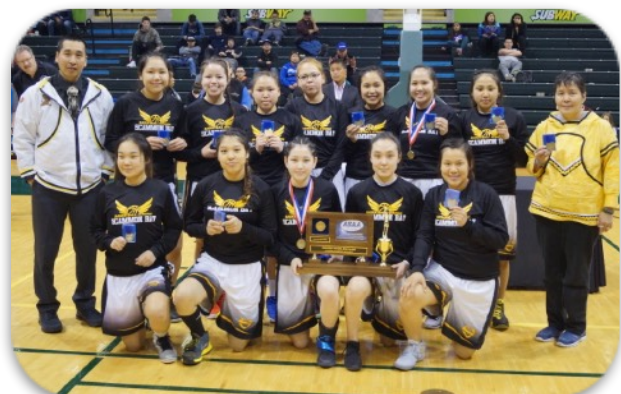
1A Girls Basketball Champions - Scammon Bay Eagles