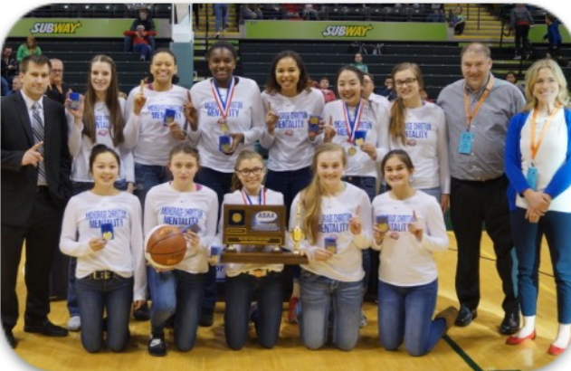
3A Girls Basketball Champions - Anchorage Christian School Lions