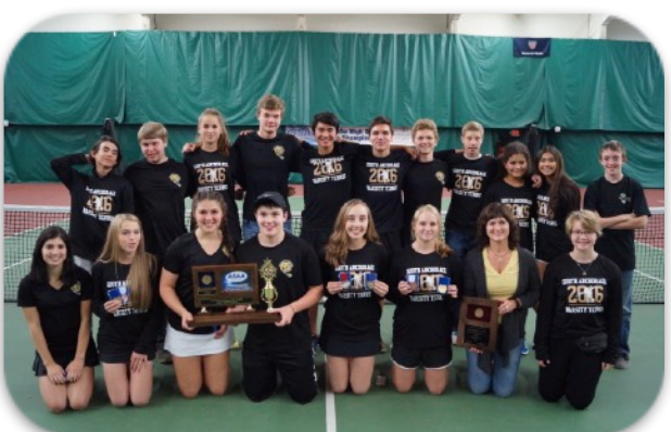
Tennis State Champion - South Anchorage Wolverines