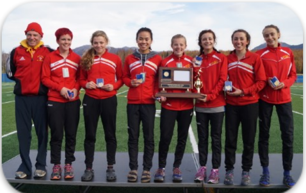
4A Girls XCR Champion - West Valley Wolfpack