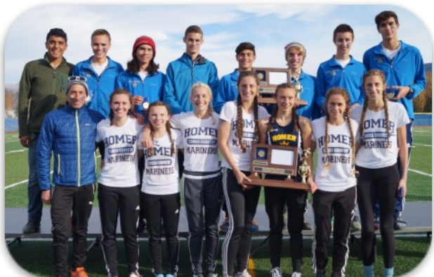
123A Boys & Girls XCR Champions - Homer Mariners