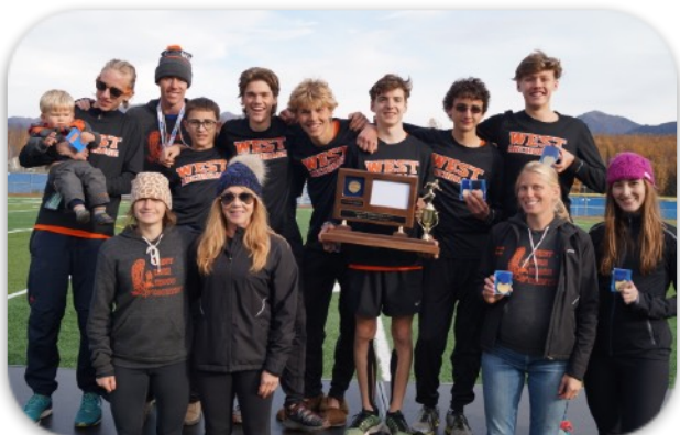
4A Boys XCR Champion - West Anchorage Eagles