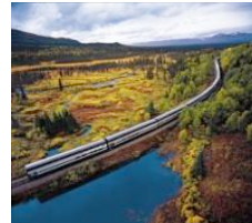
Railtours 2 for 1 special!

► Up to 50% off or 3 rd night FREE at Denali Princess Lodge and Kenai Princess Lodge all summer!