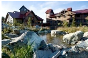
Denali Princess Lodge $149 per night!

Princess Lodges has a savings plan for you with amazing deals and great availability at our top locations!