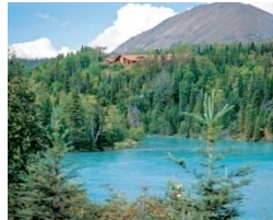
Kenai Princess Lodge $149 per night!