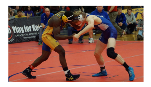
ASAA/FIRST NATIONAL BANK ALASKA WRESTLING STATE CHAMPIONSHIPS December 15-16, 2017 Alaska Airlines Center, Anchorage