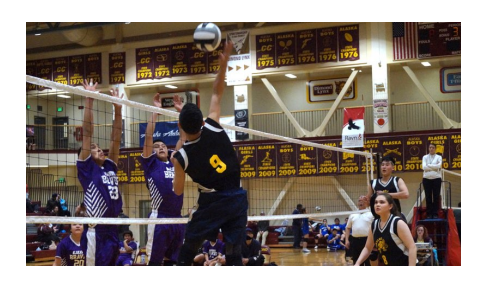
ASAA/FIRST NATIONAL BANK ALASKA MIX SIX/2A VOLLEYBALL CHAMPIONSHIPS

November 30 - December 2, 2017 Dimond High School More Information