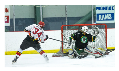
ASAA FIRST NATIONAL CUP DI HOCKEY STATE CHAMPIONSHIP February 8-10, 2018 Curtis Menard Sports Complex More Information