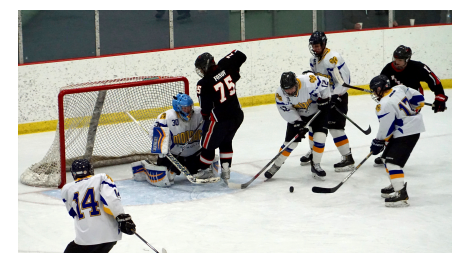
ASAA FIRST NATIONAL CUP DII HOCKEY STATE CHAMPIONSHIP February 1-3, 2018 Big Lake Lions Recreation Center More Information