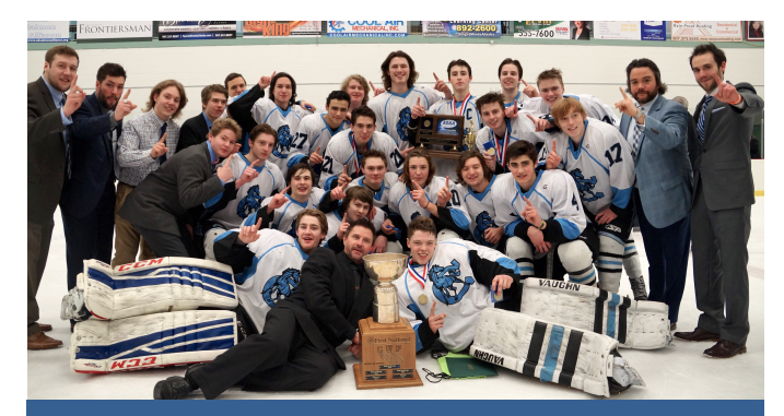
CHUGIAK MUSTANGS 2017 4A HOCKEY STATE CHAMPIONS