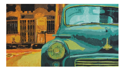
ASAA/FIRST NATIONAL BANK ALASKA ALL-STATE ART COMPETITION April 21, 2017 Displayed at ArtAlaska.org website More Information