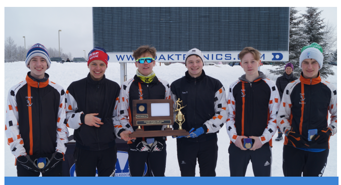
WEST ANCHORAGE EAGLES 2017 BOYS TEAM NORDIC SKI STATE CHAMPIONS