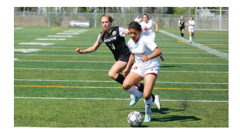
ASAA/FIRST NATIONAL BANK ALASKA SOCCER STATE CHAMPIONSHIPS May 25-27, 2017 Service HS & Eagle River HS More Information