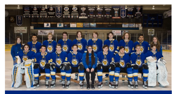
MONROE CATHOLIC 2017 GREATLAND HOCKEY STATE CHAMPIONS