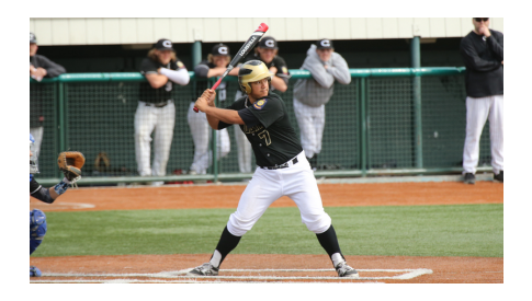
ASAA/FIRST NATIONAL BANK ALASKA BASEBALL STATE CHAMPIONSHIP June 1-3, 2017 Mulcahy Stadium in Anchorage More Information