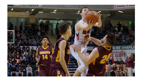
ASAA MARCH MADNESS ALASKA 1A/2A BASKETBALL CHAMPIONSHIPS March 15-18, 2017 Alaska Airlines Center in Anchorage More Information