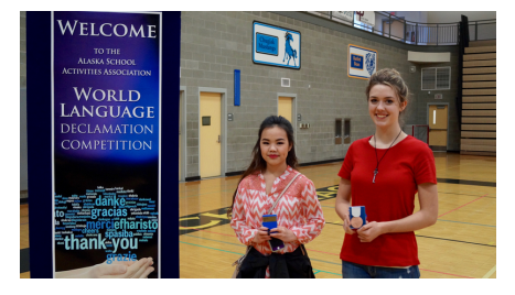
ASAA/FIRST NATIONAL BANK ALASKA WORLD LANGUAGE DECLAMATION March 4, 2017 South Anchorage High School More Information