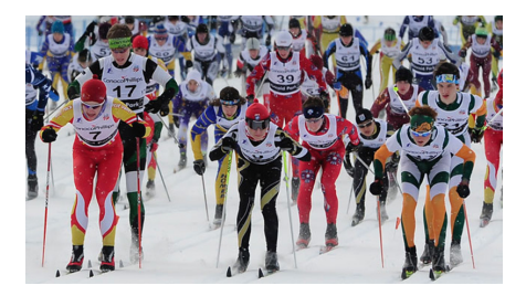
ASAA/FIRST NATIONAL BANK ALASKA NORDIC SKI STATE CHAMPIONSHIPS February 23-25, 2017 Kincaid Park Trails in Anchorage More Information