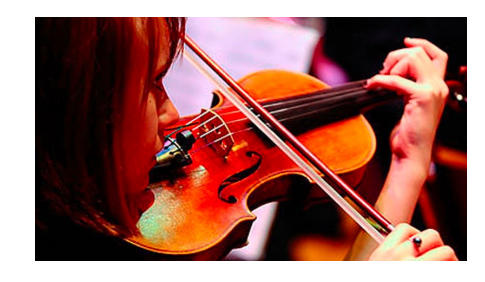
ASAA/FIRST NATIONAL BANK ALASKA ALL-STATE MUSIC FESTIVAL

November 17-18-19, 2016 East Anchorage & West Anchorage HS More Information