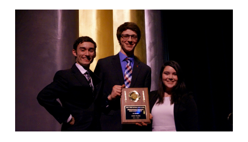
ASAA/FIRST NATIONAL BANK ALASKA DDF STATE CHAMPIONSHIPS February 23-25, 2017 East Anchorage High School More Information