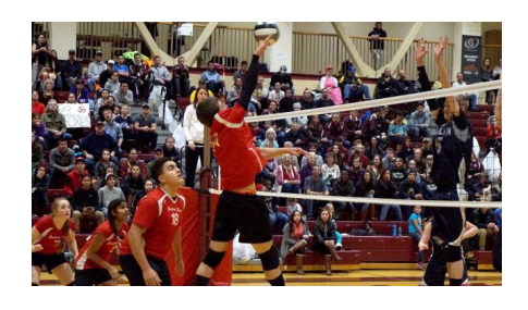
ASAA/FIRST NATIONAL BANK ALASKA 2A/MIX SIX VOLLEYBALL STATE CHAMPIONSHIPS

November 17-18-19, 2016 East Anchorage & West Anchorage HS More Information