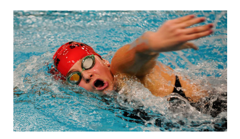
ASAA/FIRST NATIONAL BANK ALASKA SWIM & DIVE STATE CHAMPIONSHIPS November 4-5, 2016 Dimond Park Aquatic Center, Juneau More Information