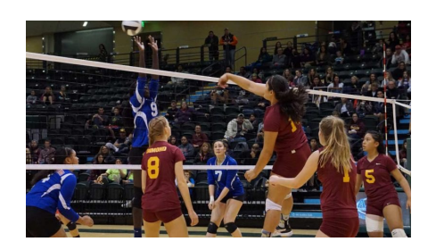
ASAA/FIRST NATIONAL BANK ALASKA 3A/4A VOLLEYBALL CHAMPIONSHIPS November 10-12, 2016 Alaska Airlines Center More Information