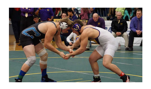
ASAA/FIRST NATIONAL BANK ALASKA WRESTLING STATE CHAMPIONSHIPS

December 8-10, 2016 Dimond High School in Anchorage More Information